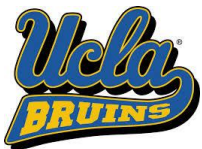
University of California-Los Angeles